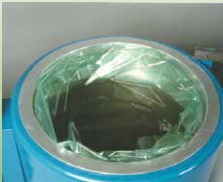
LSJRE boiling chamber filled with solvent.