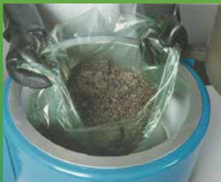
Residue is removed from the boiling chamber at process completion and disposed of according to local regulations.