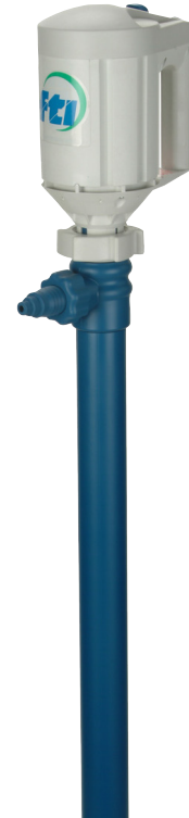
PFP with M3V motor