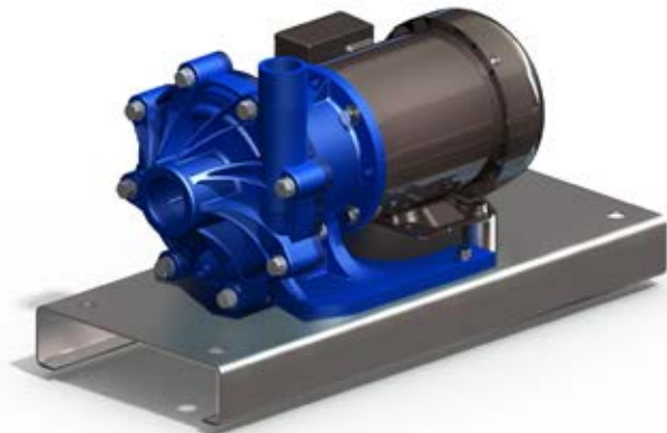
DB11P with 316SS baseplate