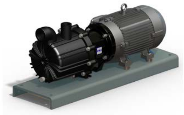
SP10V with FRP baseplate