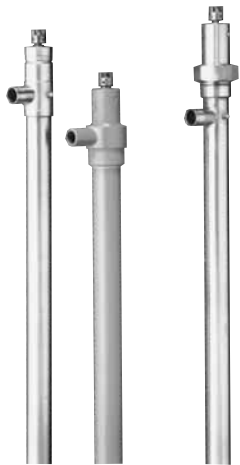
TTS TTC STTS