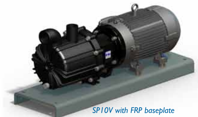
SP10V with FRP baseplate